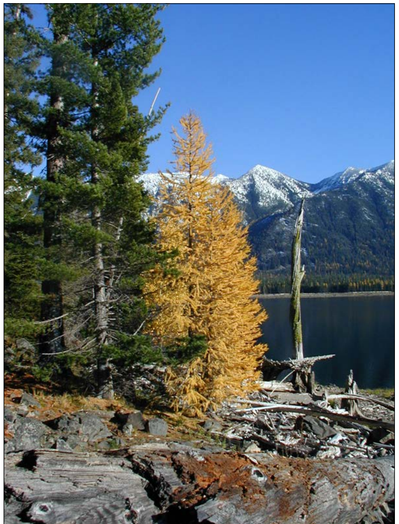
Western Larch at Bumping Lake in Autumn by Chris Maykut.

Please visit www.friendsofbumpinglake.org for the Bumping Lake slide show by Estella Leopold and for more details on what you can do and join us at on October 19 th Celebration and Fundraiser in Seattle (see page 12).