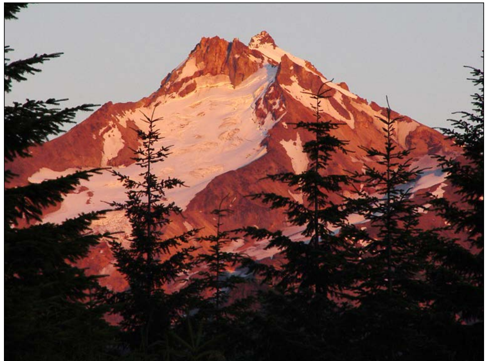
Sunset Glow on Mount Jefferson

Mount Jefferson is a 10,497 ft. stratovolcano in the central Oregon Cascade Mountains, 40 miles south of Mount Hood. It lies within the Mt. Jefferson Wilderness of the Willamette NF, as well as the Deschutes NF and the Warm Springs Indian Reservation. Sighted by the Lewis and Clark Expedition in 1806, it was named by them in honor of the Expedition's sponsor, President Thomas Jefferson. The first American ascent was in 1888. The Mazamas, founded in 1894, first attempted an ascent in 1896. It is a Required Summit for the Mazamas 16 Peaks Award. It is an important mountaineering, hiking and photographic destination for many outdoor groups.