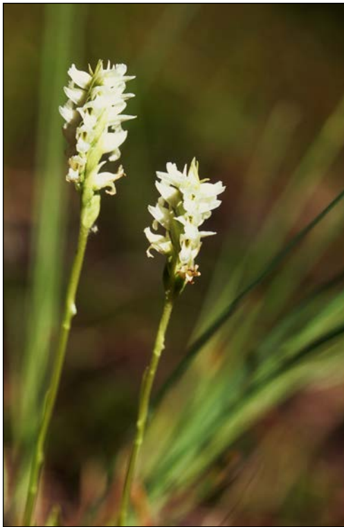
The orchid, Ladies' Tresses, on the southwest shore of Bumping Lake.