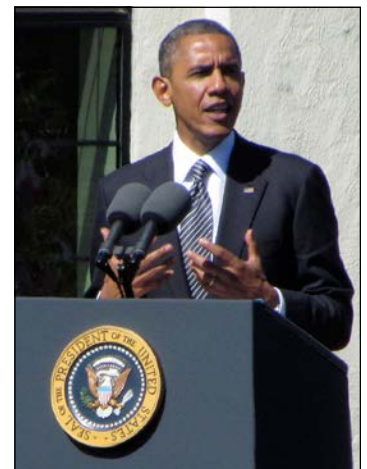
President Obama dedicates the Cesar E. Chavez National Monument.

On October 8 th , the President designated the Cesar E. Chavez National Monument in Keene, California, the home and gravesite of labor leader Cesar Chavez and headquarters of the United Farm Workers union from 1970 until Chavez's death in 1993. The site, also known as Nuestra Senora Reina de la Paz, will be managed by the National Park Service in consultation with the National Chavez Center and Cesar Chavez Foundation.