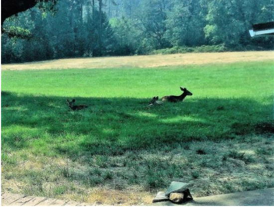
A mother doe and her fawns enjoy the shade Of a huge tree just outside our classroom