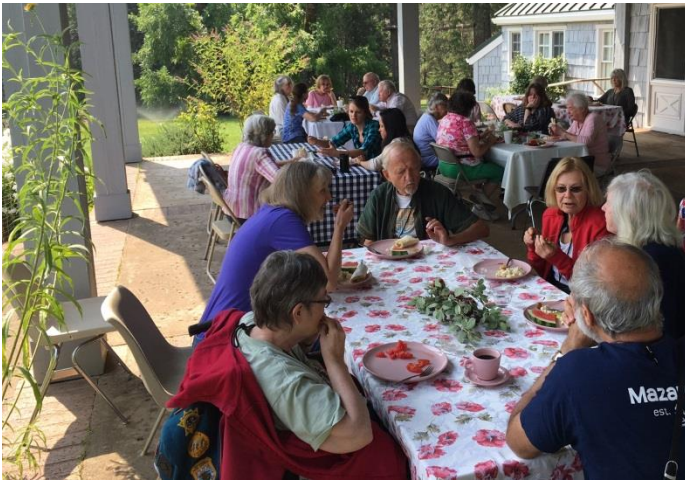
the Lunch Crowd on the covered porch