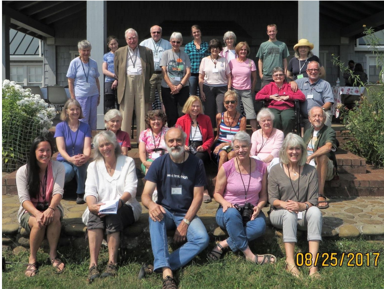
Convention Attendees Left to Right