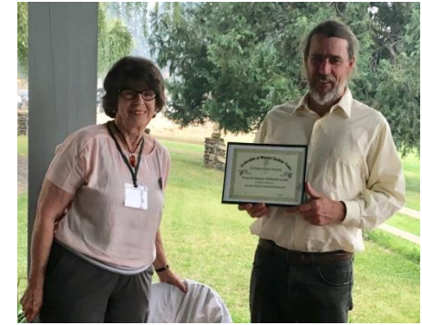
Klamath-Siskiyou Wildlands receives FWOC Service Award