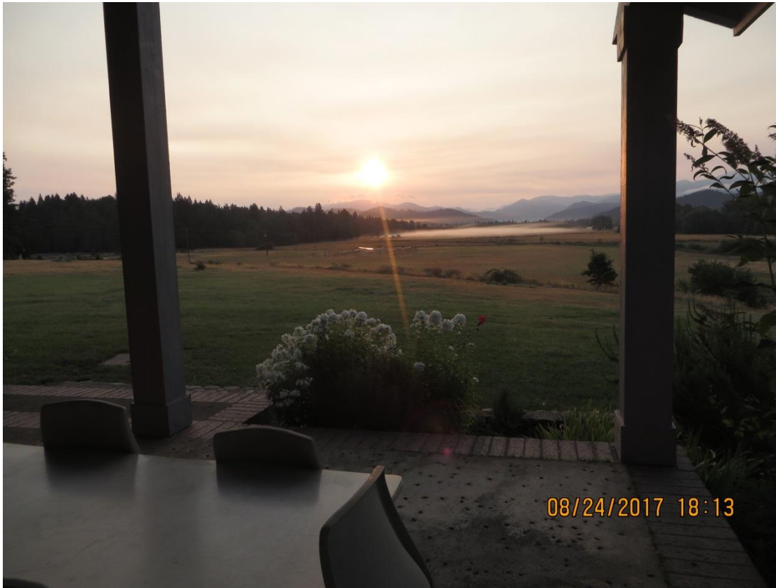
Hope on the horizon!